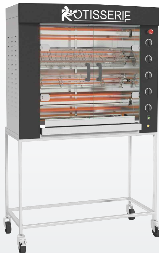
1160.4PE Black enamel

Conscious of the high energy cost involved for our clients, the Performances rotisserie has energy saving infrared burners, patented by Rotisol. A wide array of accessories enable the rapid roasting of a variety of products.