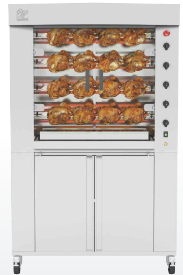
1160.4PiE Stainless steel