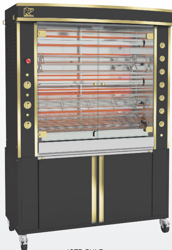
1375.5MLE Black enamel and brass